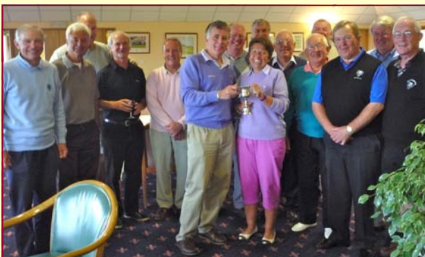
Whilst on my soapbox another great tradition of the club that seems to have slipped in recent years is that all competitors expected to turn up at the Prize giving to congratulate the winners and have a few drinks to celebrating their success. Certainly that was the case in